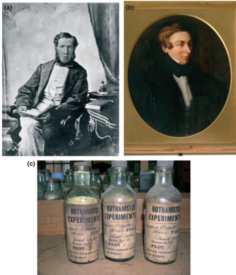
Figure 1 Rothamsted Research was the site of the earliest experiments to determine the effect of soil fertility on severity of late blight of potatoes. Portraits of (a) John Bennet Lawes and (b) Joseph Henry Gilbert, who published a paper 'Results of Experiments at Rothamsted on Growth of Potatoes: Twelve Years in Succession on the same land' in 1888 (Gilbert, 1888). Soil fertility amendments were applied and severity of potato blight was recorded. (c) Harvested potato tubers (dried, ground and placed in glass bottles) from the Hoosfield experiment are located in the Rothamsted archive. Samples of tubers were labelled 'good', 'small', 'bad' or 'diseased'.

The objectives were to address the following questions: (i) can P. infestans DNA be detected and quantified in the diseased ground potato tubers from the Hoosfield experiment; (ii) can the mtDNA haplotype be determined; and (iii) what are the relationships between the amount of P. infestans DNA in tubers, soil fertility treatment, recorded disease and yield.