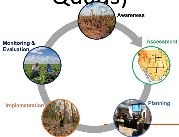
Adapted from the Fourth National Climate Assessment (2018)